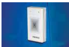
RFID reader (Optional)