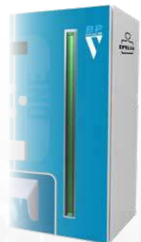
LED traffic light bar