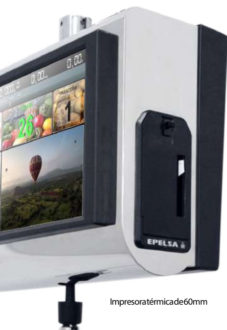
Impresora térmica de 60mm