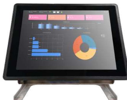
EPELSoft Label Software from CT12