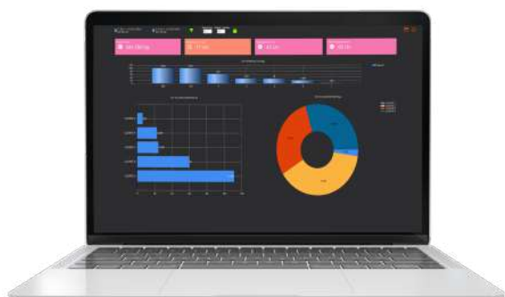
PC-based operation of the tool

EPELSoft Label is a software designed to efficiently manage product labelling from a PC. This versatile program is designed to operate on touch terminals, providing speed and agility in the labelling process. However, its flexibility also allows its use on a conventional PC with keyboard and mouse. When installed on the CT12 indicator, it transforms into a touchscreen indicator with approved weight, offering a complete solution. EPELSoft Label integrates seamlessly with various models of GODEX labellers, providing a variety of labelling options depending on the model chosen. In addition, the ability to connect to any electronic scale makes it easy to accurately capture product weight, even if it is not mounted on a CT12.